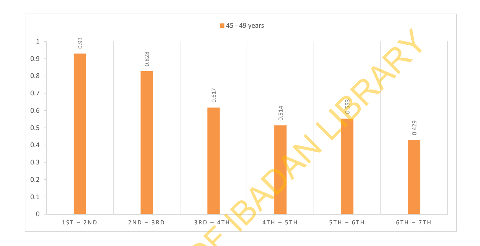
Figure 4.3: Parity Progression among women who have reached their end of childbearing age 45-49 years