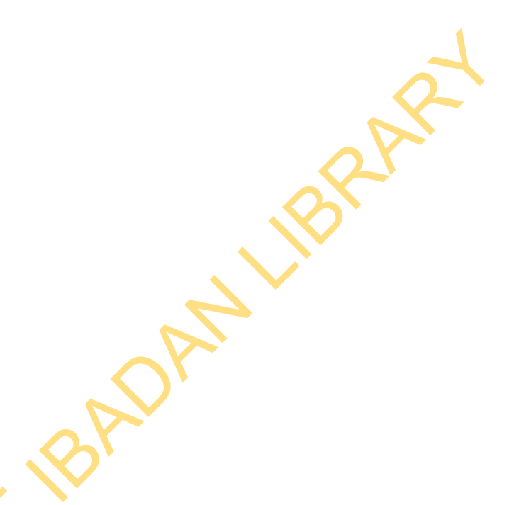
Figure 3.1: Data collection Procedure Flowchart:

Data collection flow chart by a study done in Kenya was incorporated (Kamau et al. 2017)