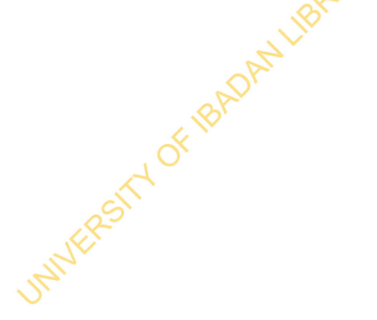
Table 4. 3: School related characteristics

Also, a significantly higher proportion of the respondents in the intervention group B group (Hand bill group) lived with both parents compared with the control group X^2 = 6.40 p = 0.01. Furthermore, a significantly higher proportion of the respondents in the intervention group B group (Hand bill group) had mother who were professional compared with the control group, X^2 = 10.95 , p = 0.01.