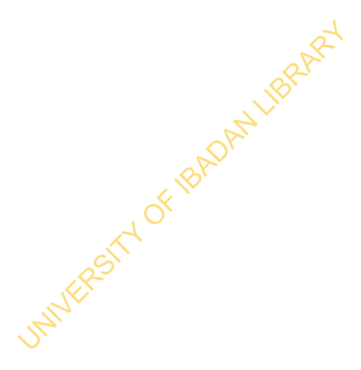
Table 4.12: Effect of intervention on Seeking Help from Informal Sources by the Respondents after Adjusting for Baseline Scores

there was a significant increase in the mean GHSB scores in the intervention group A (phone) compared with the control group p < 0.03. The ES was 0.041.