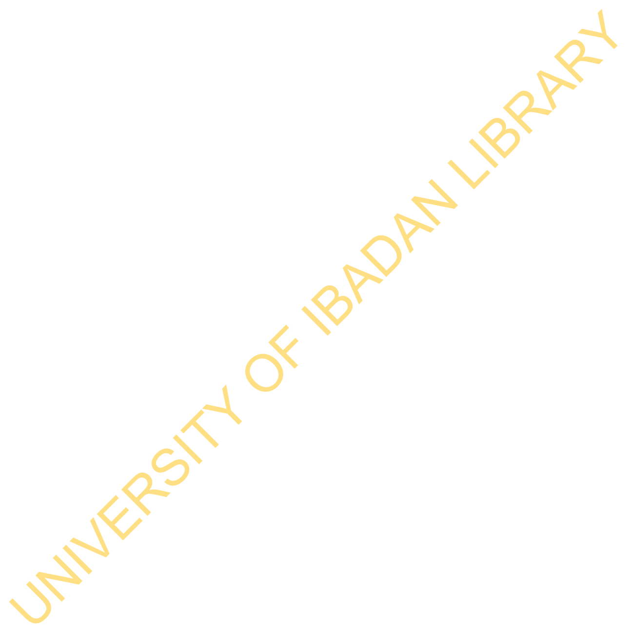
Table 4.2: Family Characteristics of Respondents

the control group X^2 = 7.89 , p = 0.01, there was no significant differences in the sociodemographic characteristics three groups.