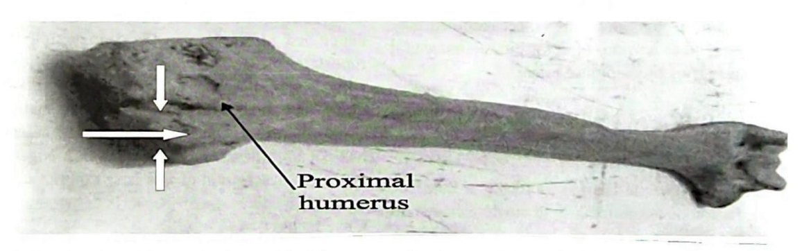
Fig 3: Anterior view of the proximal part of the left humerus with absence of the head of the humerus, but with normal greater and lesser tuberosities, and intertubercular sulcus (white arrows).