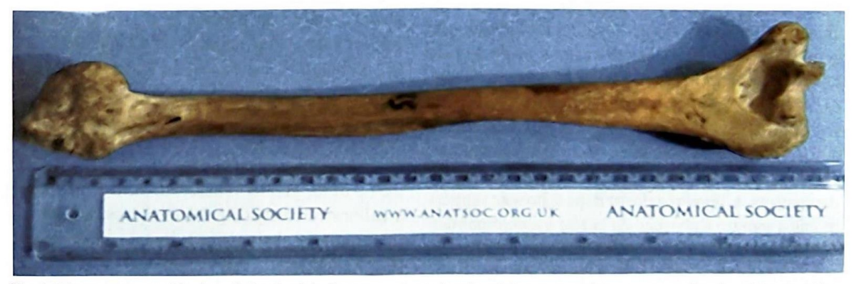
Fig 4: Measurement of the length (cm) of the humerus from the tip of the proximal humerus to the tip of the trochlea in the distal part, using a calibrated ruler

the condition is probably congenital, and represented varying degrees of a typical but hitherto unrecognized deformity of the shoulder