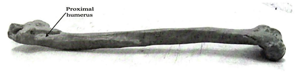
Fig 2: Lateral view of the proximal part of the left humerus with absence of the head of the humerus