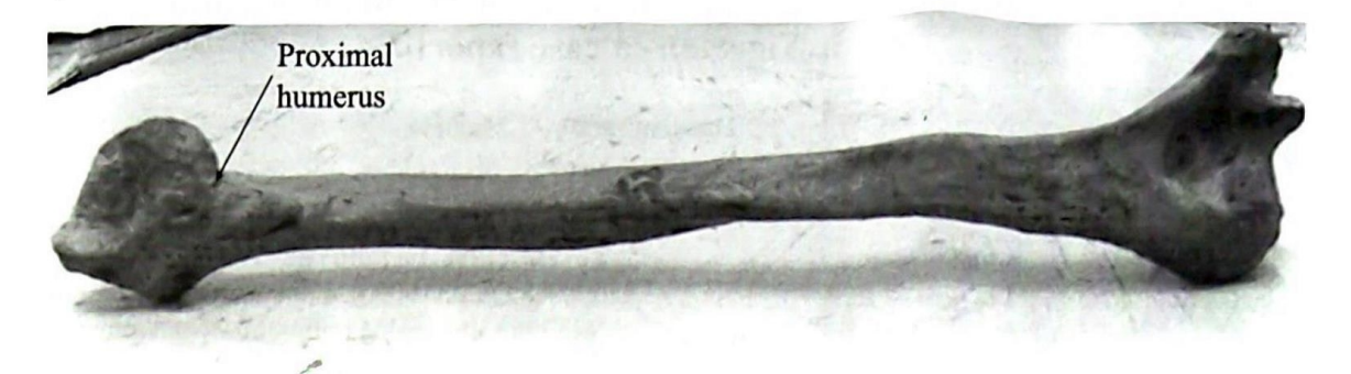
Fig 1: Posterior view of the proximal part of the left humerus with absence of the head of the humerus